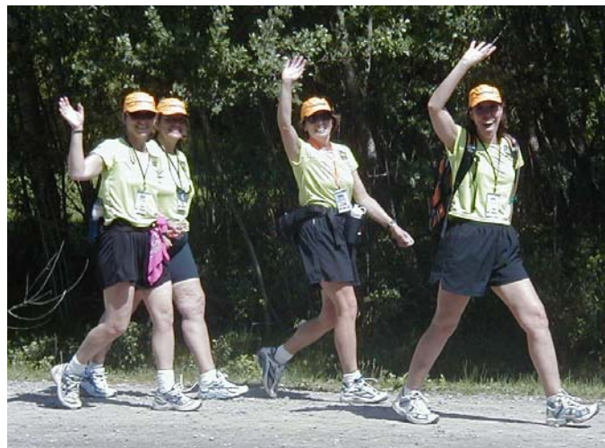
FAB (Females Against Breast cancer) Four on the road, after stopping for Gatorade 5/31/02

We did it! The idea of raising $1900 to participate was scary, but then the most amazing thing happened. We found out what wonderful friends and family we had. The outpouring of emotional and financial support was overwhelming. It continued to carry us through 60 miles of walking. As walkers were dropping by the wayside with dehydration, blisters, road rashes (even one broken leg), we sailed into camp with a feeling of euphoria, happiness, pride and strength. We learned that once you set your mind on something and have the support of family and friends you can make a difference. Thank you, thank you, thank you! Now what will do for an encore? Just wait and see.