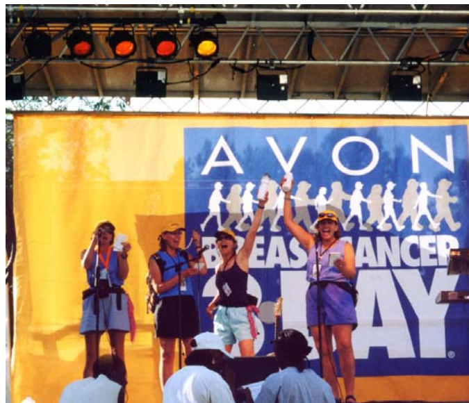
FAB Four Singing "It's Been a Long Day's Walk"

Best drink: Starbucks doubleshots at mile 15 Best surprise: "Tent angel" who pitched our tents Best quote: "Oh my gawd, are you the FAB Four?"